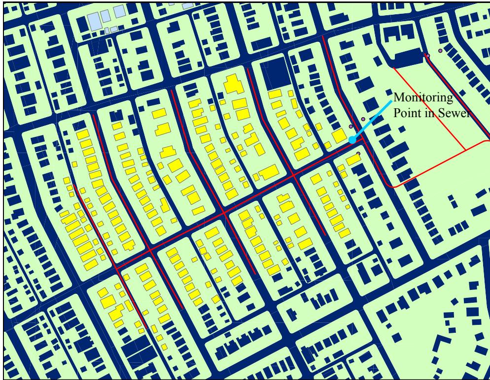
Figure 2 - An example of a micro-sewershed (Overton Street study-area) composed of sewer line in red and contributing residences in yellow.